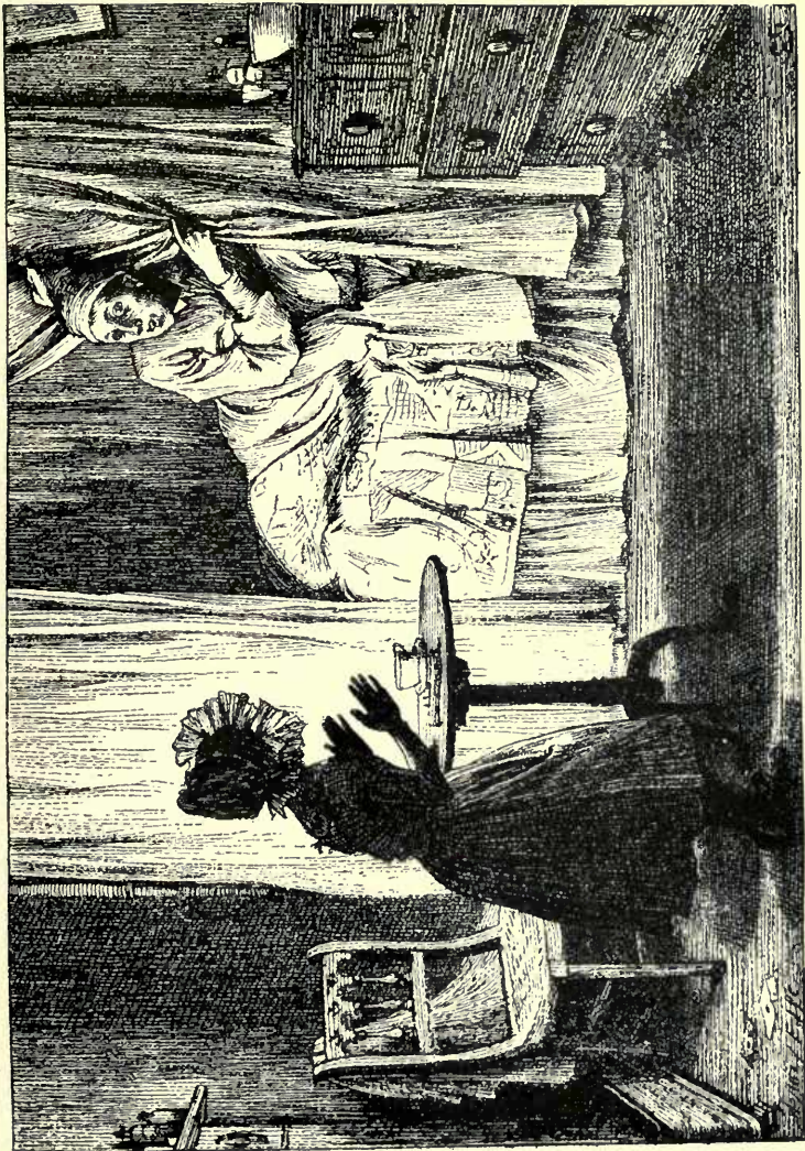
THE MARCHIONESS JUMPED UP QUICKLY AND CLAPPED HER HANDS.